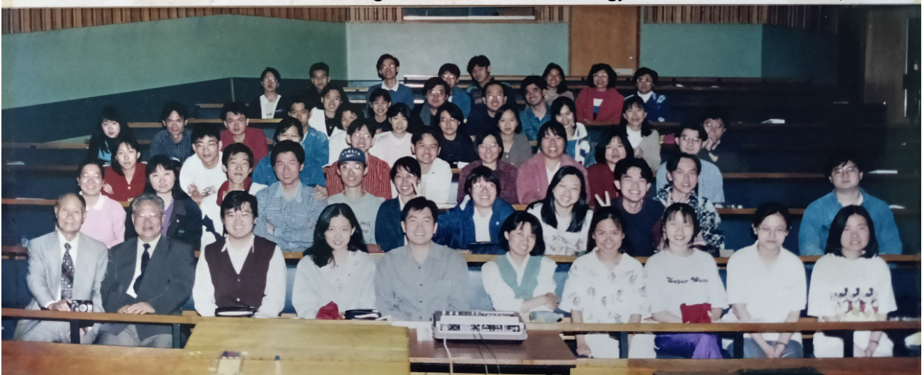
Attending the foundational theology course in Christchurch, late 1996