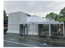
58 Albany St