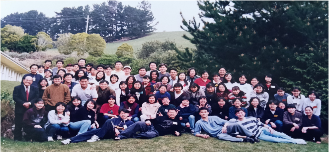
1997 第一屆福音營 全体照 Group photo of the first Gospel Camp