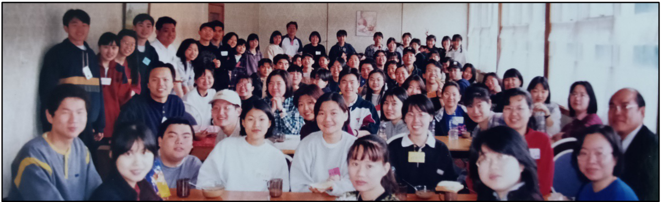
1997 第一屆福音營 全体用餐照 Group meal photo at the first Gospel Camp (1997)