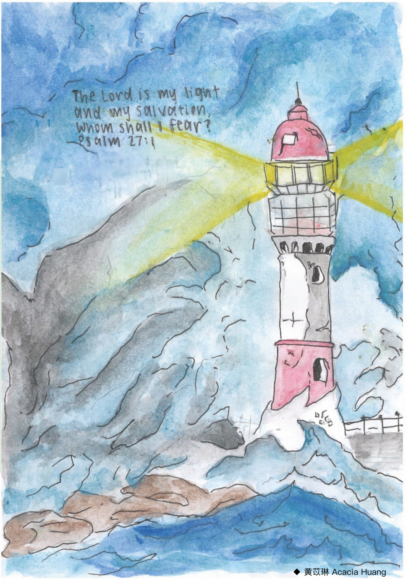
◆ 黄苡琳 Acacia Huang

The Lord is my light and my salvation, Whom shall I fear? Psalm 27:1