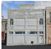
249 Ravensbourne Rd