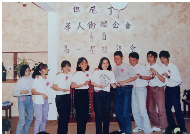
Group photo during lunch at the 1997 retreat