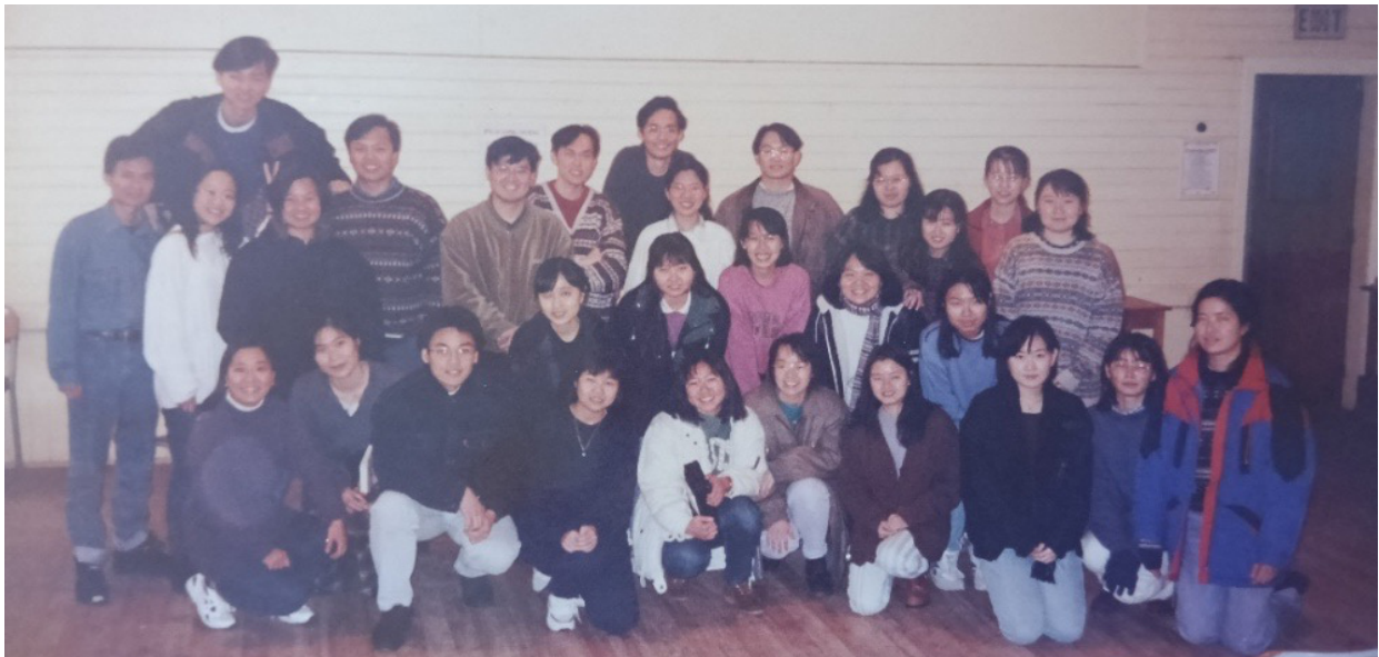
1996/04/07 但尼丁华人卫理公会成立 圣堂内留攝

1996/04/07 Thanksgiving service for the establishment of the Dunedin Chinese Methodist Church