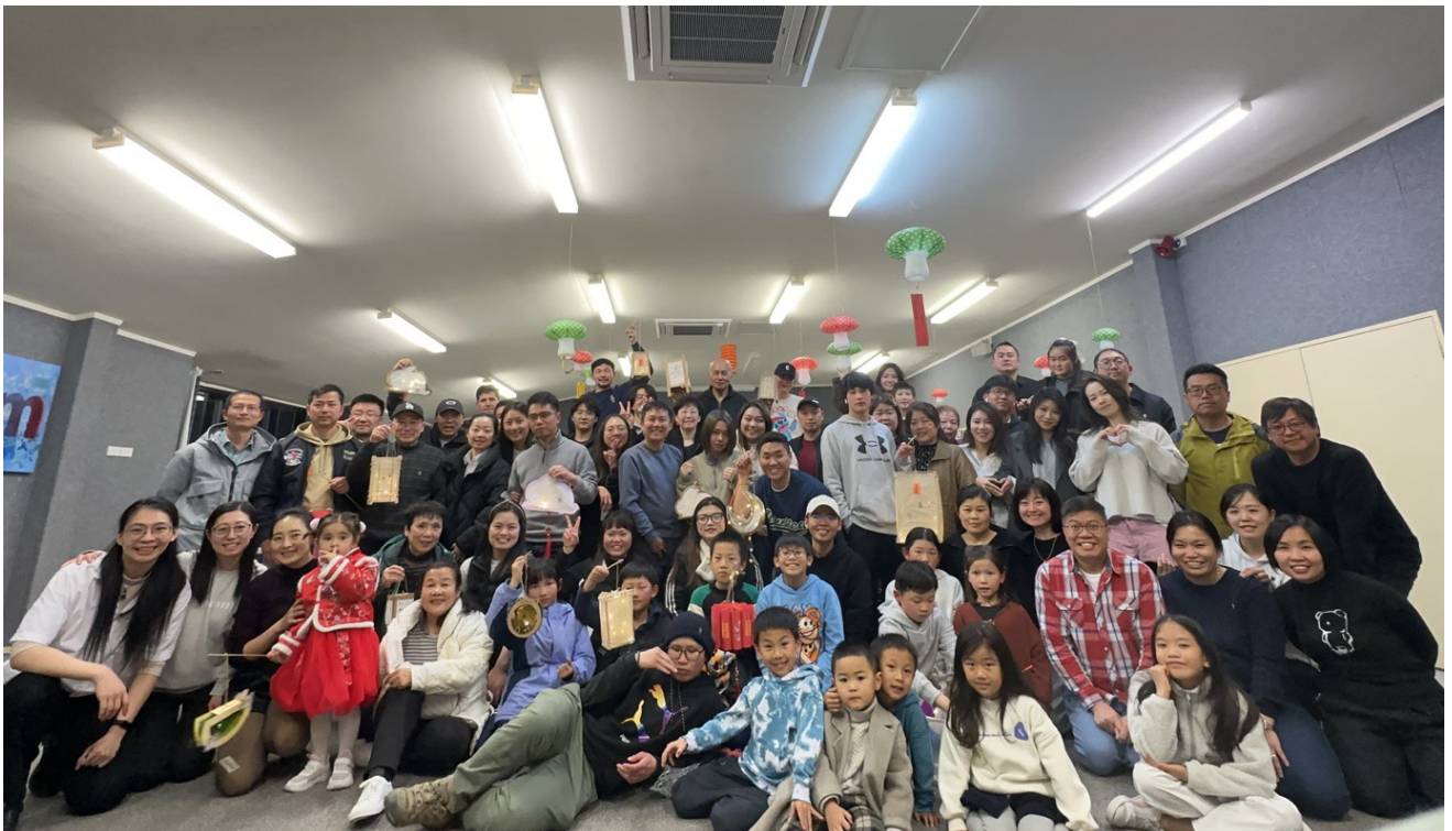
中秋节2024年 Mooncake Festival 2024

May the Lord guide the path ahead for the Queenstown mission centre, and may His will be accomplished.