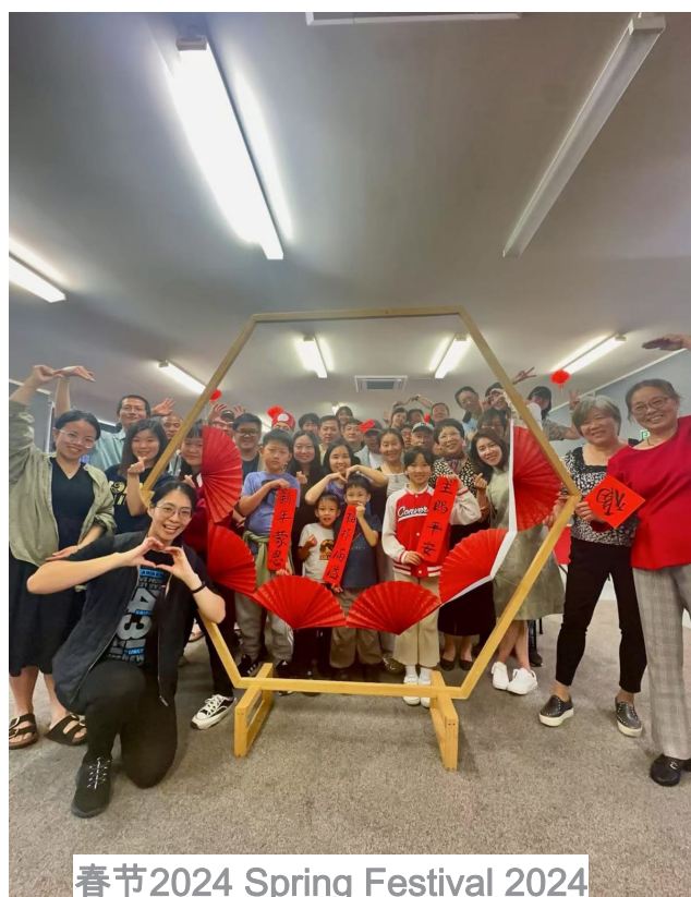
春节2024 Spring Festival 2024

Pray that the Lord Jesus will touch the hearts of new friends, so they will be willing to accept the Gospel and believe in the Lord as their Savior.